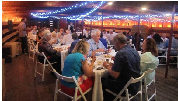
Dinner tables in the ‘tween decks