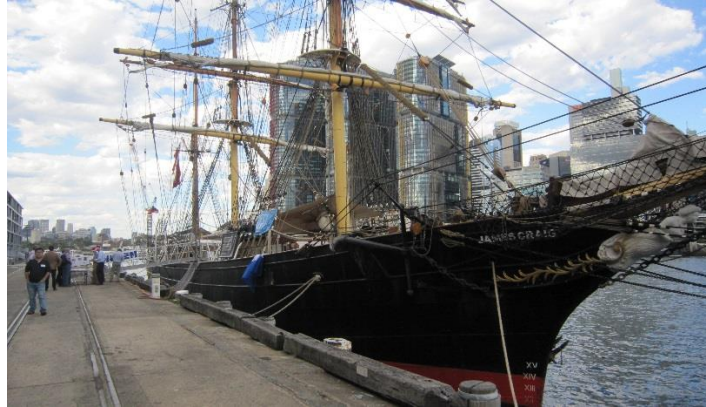
James Craig at her Wharf 7 berth, with the registration desk in action

The eighteenth SMIX (Sydney Marine Industry Christmas) Bash was held on Thursday 7 December aboard the beautifully-restored James Craig alongside Wharf 7, Darling Harbour, from 1730 to 2130. The Bash was organised jointly by the IMarEST (Sydney Branch) and RINA (NSW Section). About 185 guests came from the full spectrum of the marine industry, including naval architects, marine engineers, drafters, boatbuilders, machinery and equipment suppliers, regulators, classifiers, surveyors, operators, managers, pilots, navigators, researchers, and educators. Equally importantly, the full spectrum of age groups was represented, from present students to the elders of the marine community.