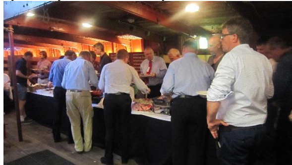
The buffet table in the ‘tween decks

“Early bird” pricing and credit-card facilities for “early bird” payments continue to be successful, and all tickets were sold before the event — you really do have to be early!