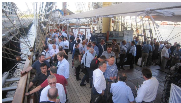
Some of the crowd enjoying pre-dinner drinks and canapes on board James Craig