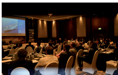
UAE Branch Technical Meeting

'Anchor My Heart', for which she was awarded the 'Young Seafarers' Achievement Award' by the Indian Ministry of Shipping, India.