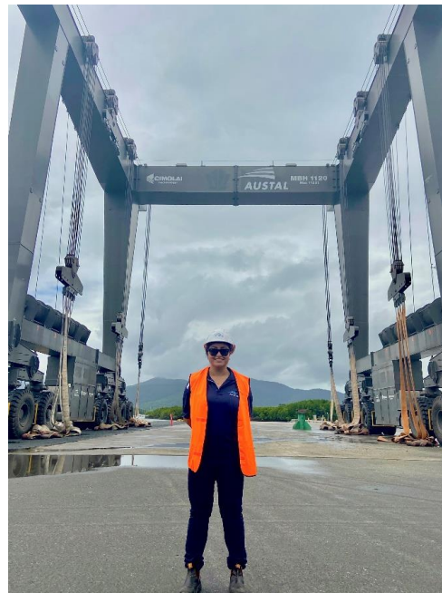
Photographed at Austal Cairns Service Centre