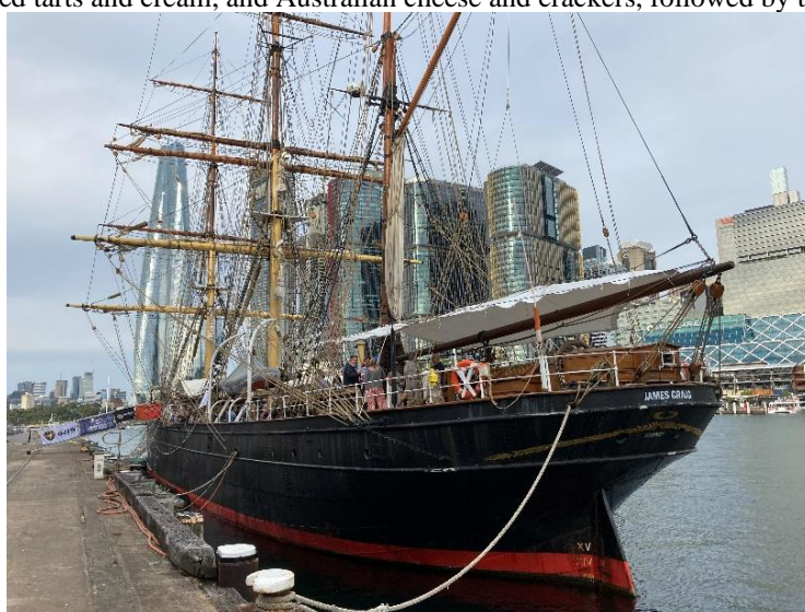
James Craig alongside Wharf 7 in the late afternoon

Drinks (beer, champagne, wine and soft drinks) and finger food (parmesan-crusted chicken skewers and salt-and-pepper prawn cutlets with a chili glaze) were served on the main deck. A delicious buffet dinner was served in the 'tween decks, including hot, cold and salad selections, and mixed breads and butter. Desserts included individual ice-creams, mini mixed tarts and cream, and Australian cheese and crackers, followed by tea and coffee.