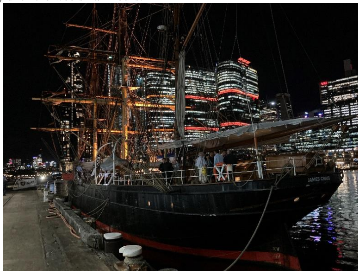
James Craig alongside Wharf 7 in the late evening

It is rumoured that some of the stayers, who were shown the gangplank late in the piece, rocked on to other venues and continued to party until the wee small hours.