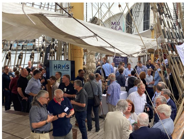
Some of the crowd enjoying drinks and finger food on board James Craig