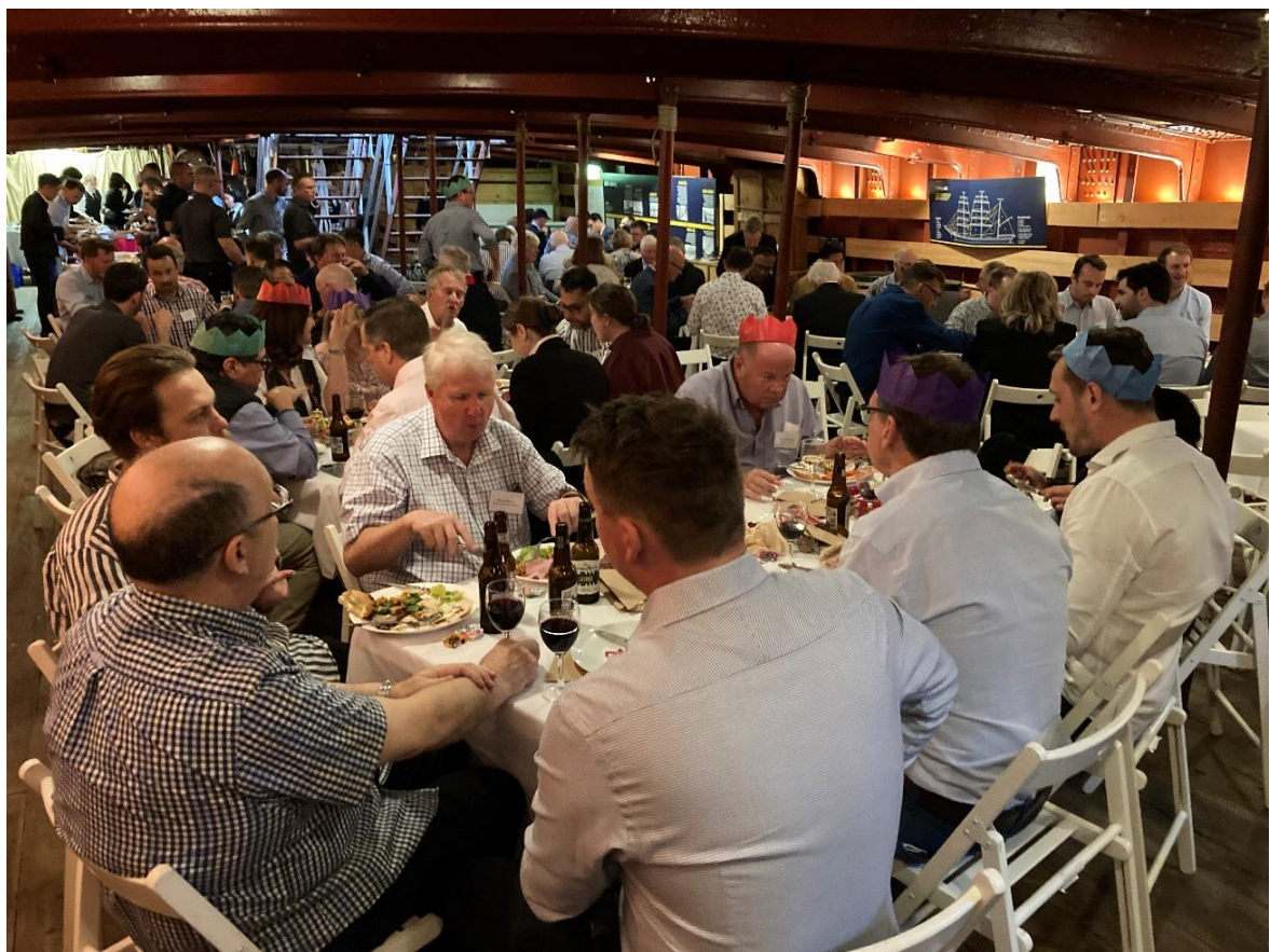
Dinner in the 'tween decks