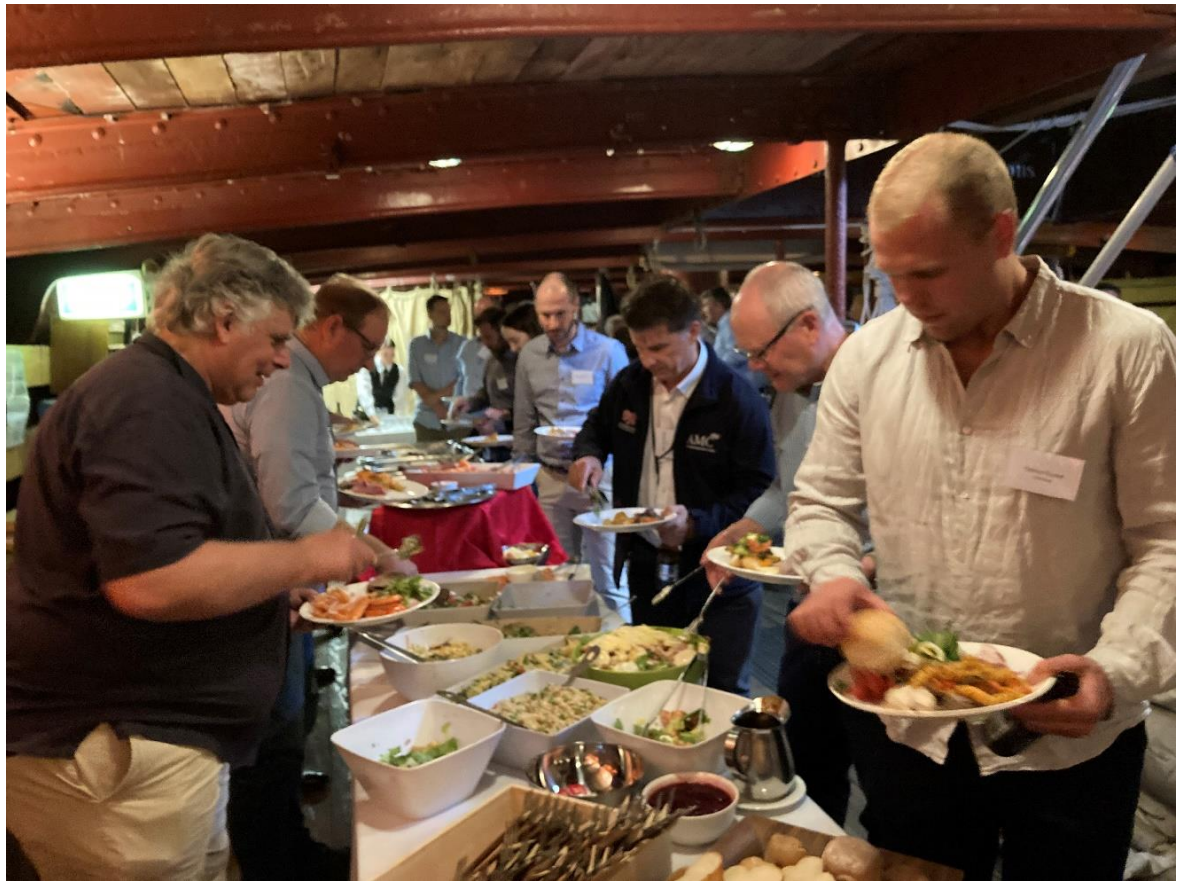
The servery for dinner in the 'tween decks