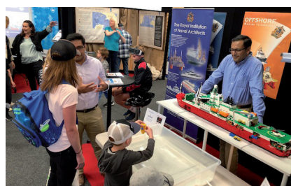
The Western Australia Stand at Maritime Day

The Western Australia Section exhibited at Maritime Day, organised recently by Port of Fremantle. On the stand was a LEGO model, kindly offered by Knud E. Hansen Australia P/L, along with a "model testing facility for ship stability".