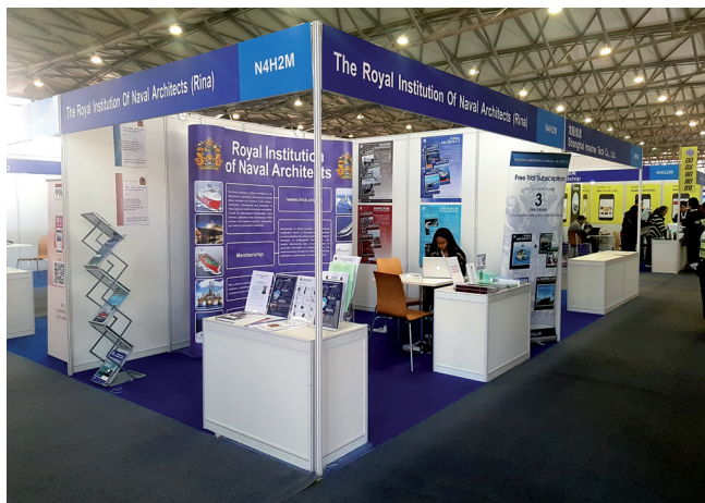
The RINA stand at Marintec China 2019

The RINA Stand at Marintec China 2019 in Shanghai gave members the opportunity to catch up with the Institution's activities, and for potential members, advertisers and sponsors to learn more about the Institution.