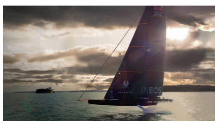
The modern America's Cup Yacht

https://www.dropbox.com/sh/i9avigb0400txzl/AACrQdW-3iA1eMZVa06YFbbua?dl=0