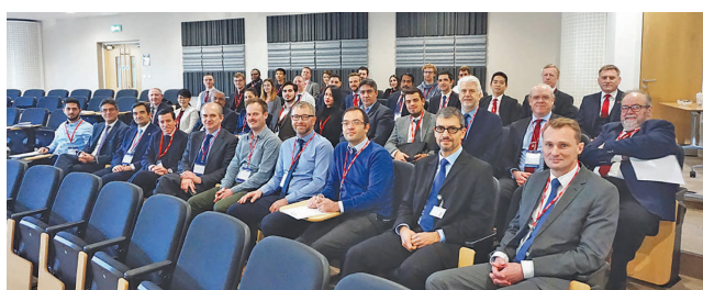
Delegates at the International Conference on the Design, Construction and Operation of LNG/LPG Ships

Papers presented at the IWWP may be read at click here . Selected papers will be considered for publication in the International Journal of Small Craft Technology .