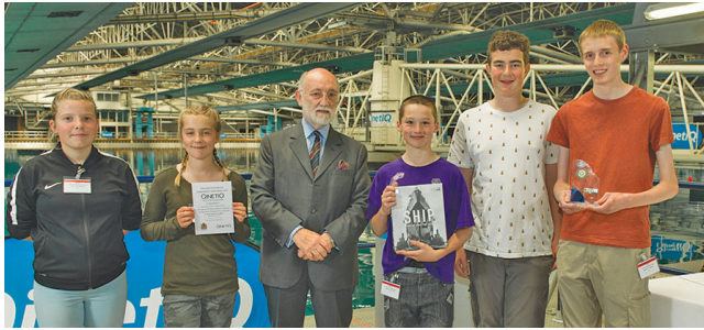
Budmouth College, winners of the Team Prize