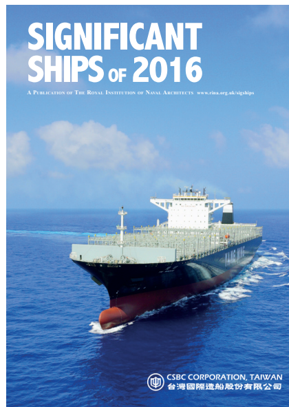
Significant Ships of 2016

The annual RINA publications Significant Ships of 2016 and