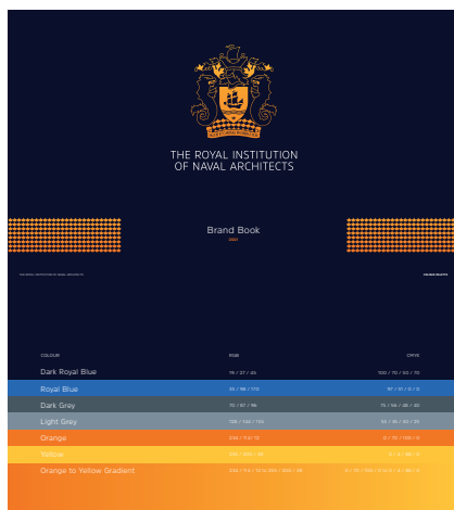
Figure 1. Brand Book taken from college of arms approved colours

THE ROYAL INSTITUTION OF NAVAL ARCHITECTS