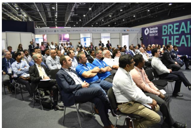
Members and Guests