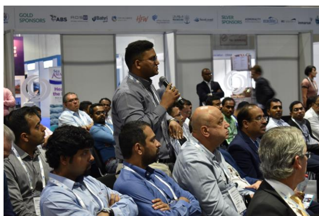
Members and Guests