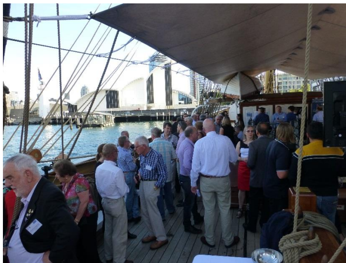
More of the crowd enjoying drinks on board James Craig