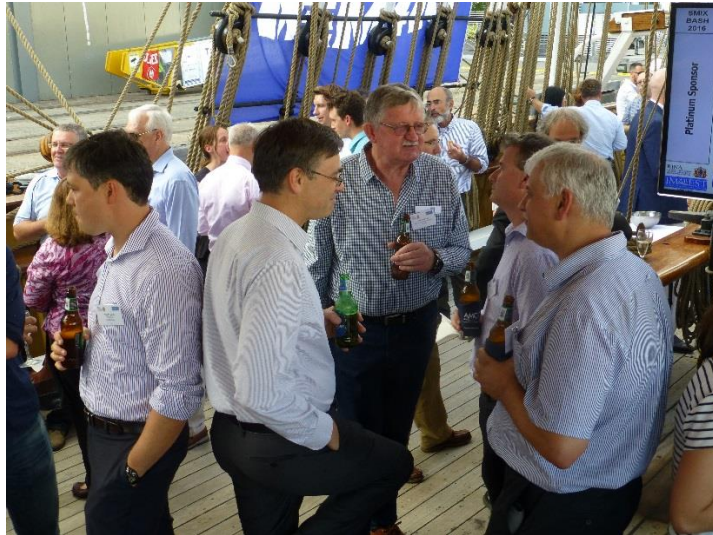
More of the crowd enjoying drinks on board James Craig