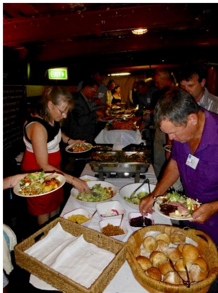
Servery in the 'tween decks (Photo courtesy Graham Taylor)