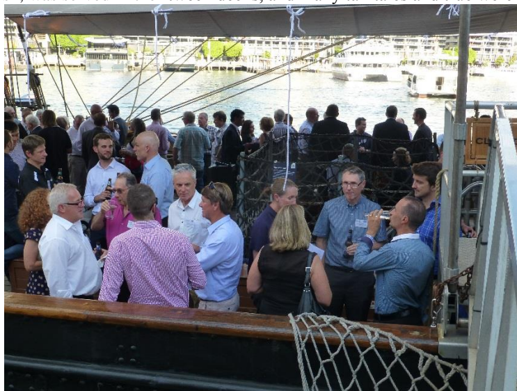
Some of the crowd enjoying drinks on board James Craig

Sydney turned on a perfect evening, and many partners in attendance enjoyed the view from the decks of James Craig . Drinks (beer, champagne, wine and soft drinks) and finger food (spring rolls and prawns) were provided. A delicious buffet dinner of stuffed turkey, salads, pasta and bread rolls for mains, and mini ice-creams and cheese platters to finish, was served in the 'tween decks, and many tall tales and true were told.