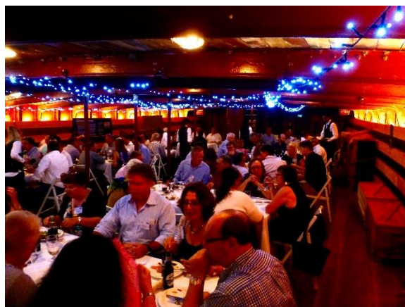
Dinner in the 'tween decks