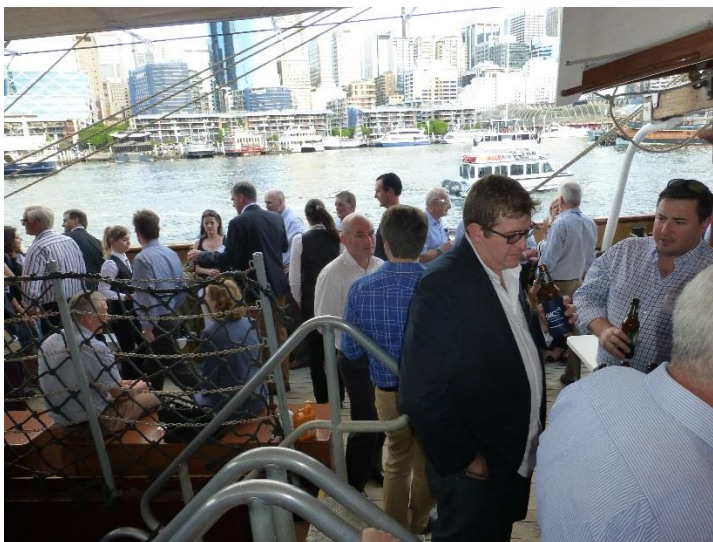
More of the crowd enjoying drinks on board James Craig