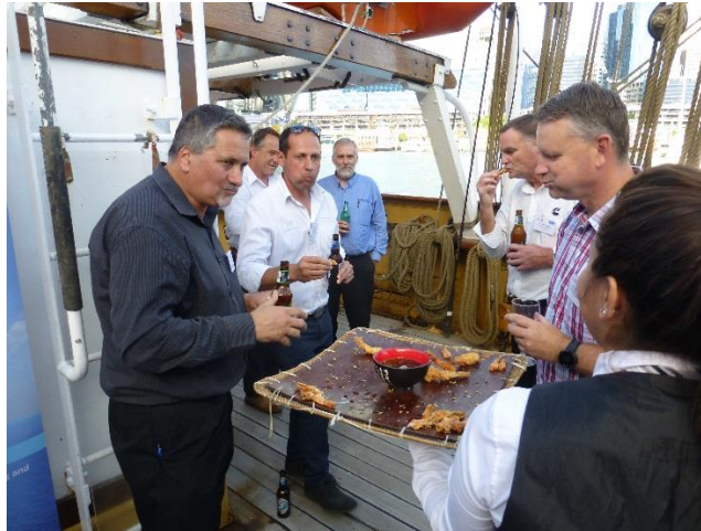
Finger food on board James Craig