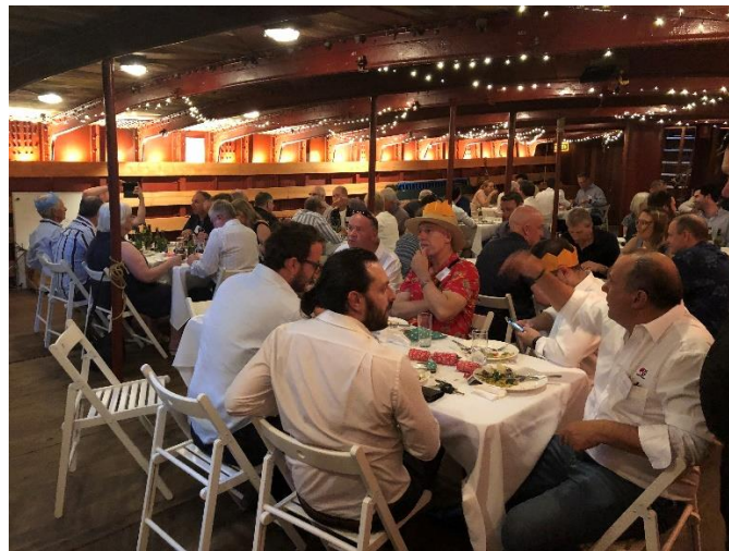
Dinner in the tween deck

This year's event was sponsored by the following organisations: