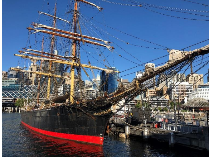
James Craig berthed at the North Wharf, Darling Harbour

Following the cancellation of SMIX Bash 2020 due to the pandemic, the 21st SMIX (Sydney Marine Industry Christmas) Bash was held on Thursday 2 December 2021 aboard the beautifully-restored James Craig alongside the North Wharf, Darling Harbour, from 1730 to 2130. The event was organised jointly by RINA (NSW Section) and the IMarEST (ACT & NSW Branch). About 150 guests (limited by pandemic restrictions) came from the full spectrum of the marine industry, including naval architects, marine engineers, drafters, boatbuilders, machinery and equipment suppliers, regulators, classifiers, surveyors, operators, managers, pilots, navigators, researchers, and educators. Equally importantly, the full spectrum of age groups was represented, from recent graduates to the elders of the marine community. Sydney turned on a beautiful evening, and many partners in attendance enjoyed the view of Darling Harbour and the city lights from the decks of James Craig .