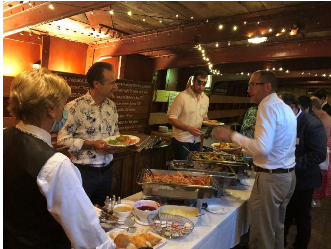
Buffet servery in the tween deck

A delicious buffet dinner (roasted beef fillet served with a shiraz jus, seasoned turkey breast roast with cranberry, honey leg ham, roasted seasonal vegetables, herb buttered chat potatoes, penne pasta tossed in pesto, Sydney rock oysters, smoked salmon, BBQ marinated octopus and calamari, and Greek, coleslaw, Caesar, Tabouli, and Vietnamese noodle salads, with brewed coffee and tea selection) was served in the 'tween decks, with afters (individual ice creams, mini mixed tarts and cream, and Australian cheese and crackers) served on deck, and many tall tales and true were told.