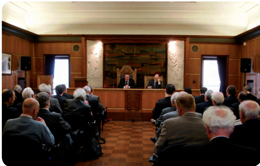
The President opens the 2009 AGM at RINA Headquarters

Elections to Council and awards of prizes and medals are announced at the 2009 AGM, which was followed by the presidents address.