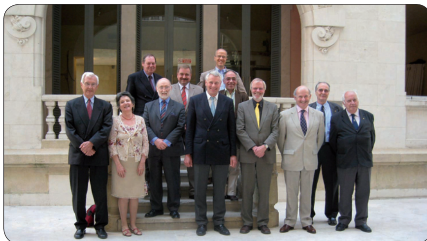
The CEMT Council meets at the headquarters of the Ordem dos Engenheiros in Lisbon.