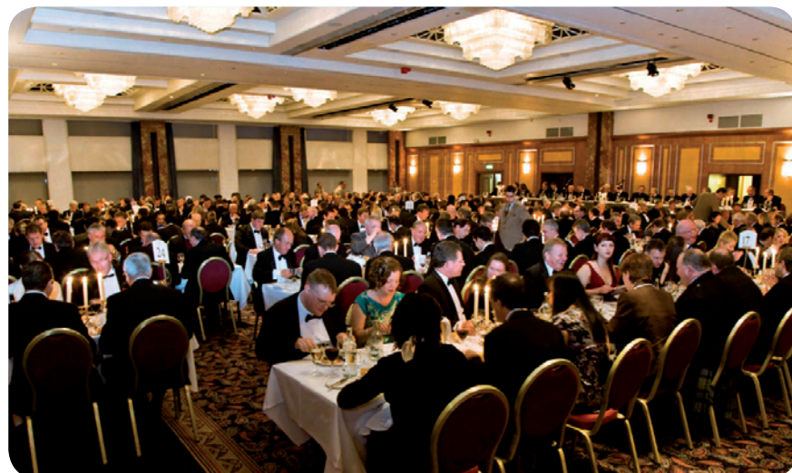
Members and Guests at the 2009 Annual Dinner

He stated that the Royal Institution of Naval Architects strongly believed that safety began with good design and continued with sound construction and skilled operation. Naval architects were involved in all these aspects and their work was fundamental to achieving safer operations at sea. The RINA-Lloyds Register Educational Trust Ship Safety Awards recognised recent innovations by naval architects and others which had led to an improvement of safety at sea, or which had the potential to do so. The purpose of these Awards was to both encourage such